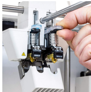
Print core BB Quick-swap nozzles for build and water-soluble support materials. Available in 0.25, 0.4, and 0.8 mm