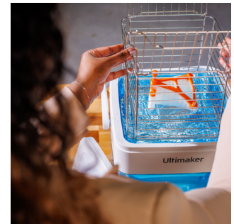
PVA Removal Station Remove water-soluble PVA support material up to 4X faster